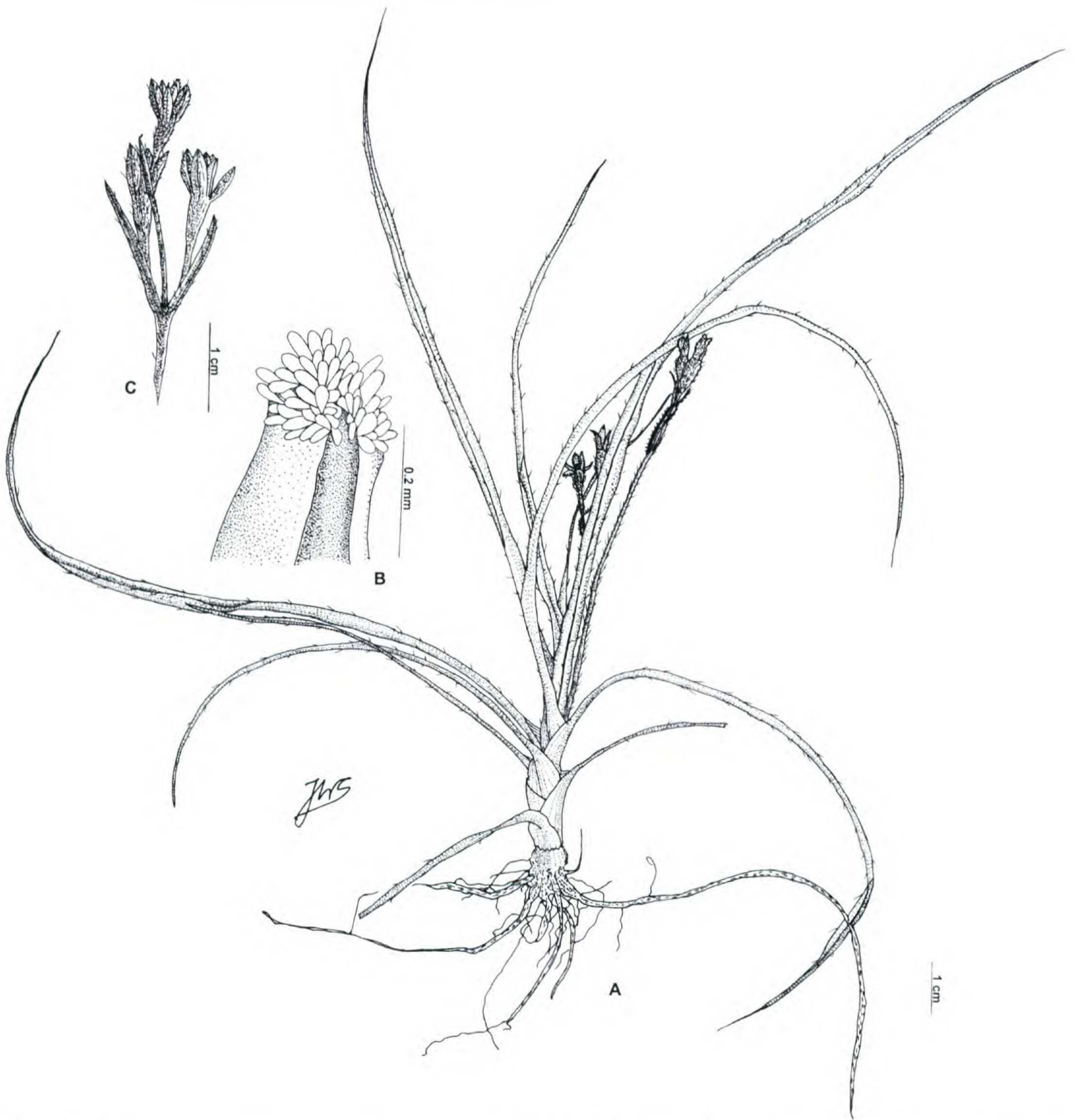
Figure 3. Hypoxis angustifolia var. madagascariensis Wiland. —A. Habit. —B. Papillae on apex of inner tepal. —C. Inflorescence. A & B from Rakoto & Turk 83, MO; C from Zjhra & Hutcheon 273 (MO).

gascar there is no distinct difference in geographical distribution or habitat preference between these two taxa. Field studies are needed to evaluate the relationship between them.